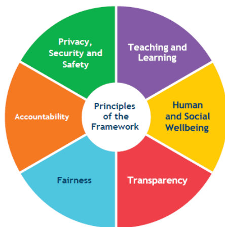
Education360. (2023, December 11). Navigating the future: The Australian framework for generative artificial intelligence in schools. Education360 .

Brisbane Catholic Education has been named an ambassador for the Rome Call for AI Ethics, making it the first Australian organisation and the first K-12 organisation globally to receive this recognition. BCE’s mission to teach, challenge, and transform aligns with the initiative’s goals, emphasising ethical AI practices guided by our values of Excellence, Integrity, Justice, and Hope. As an ambassador, BCE commits to transparency, inclusion, responsibility, impartiality, reliability, and security and privacy in its AI systems. This includes ensuring AI tools are accessible to all students, integrating AI ethics into the curriculum, and prioritising data security and privacy. BCE’s involvement highlights its dedication to ethical AI use and is a testament to our dedication to using technology as a leverage for the common good, ensuring that it serves to enrich and deepen the lives of all those we reach, grounded in the principles of Laudato Si’ and Catholic Social Teachings. This policy is based on the AI Framework’s 6 Principles and 25 Guiding Statements, which highlight how these principles work together in education. The six principles are: